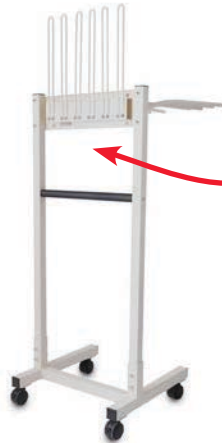
Standard WITH Glove Rack #ARM-G60

E-Z Roll, 3" medical grade, swivel, locking casters!