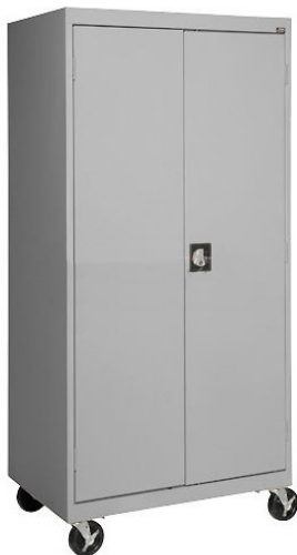
Locker in Gray