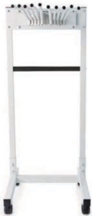
Standard Mobile Rack #ARM-100

E-Z Roll, 3" medical grade, swivel, locking casters!